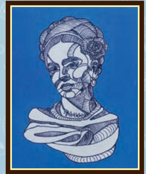
VASIHNAVI JEETA IBDP-1